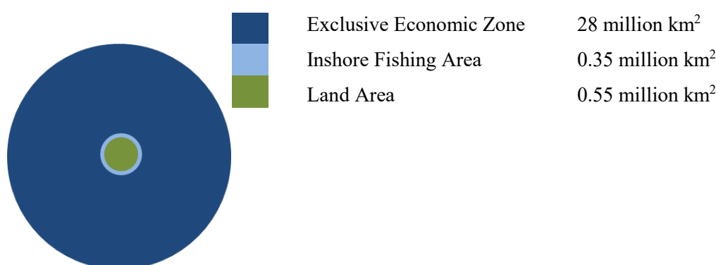
Figure 1. Relative area of land (green), ocean (dark blue) and inshore fishing areas (light blue) of Pacific Island Countries and Territories 1

1. The exclusive economic zones of the 22 Pacific Island Countries and Territories (PICTs) span much of the tropical and subtropical Pacific Ocean, encompassing an area that exceeds 27 million km 2 or 8 percent of the global ocean, while coastal fishing areas across the Pacific account for only 1.25 percent of this ocean area. However, the coastal and marine environments play a major role in the economic, social and cultural well-being of Pacific Islanders and sustain a multitude of important activities that fuel local, national and international economies and provide livelihoods and food security for millions of people.